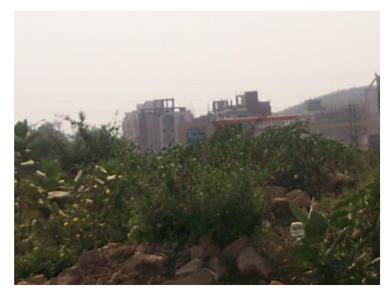
Figure 3: Real estate construction going on .......( Sirol village, Gwalior)

Few townships construction is on progress in these hilly regions which has totally changed the earlier ecosystems at the place of their development.