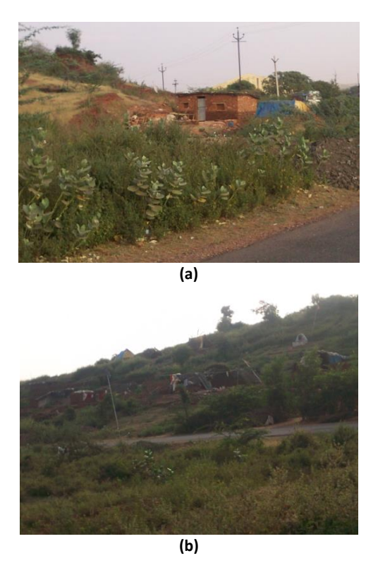
Figure 5 (a, b): Colonization on hill slopes, Ohadpur village, Gwalior.

Illegal construction of houses by local people on the hill slopes is also a great threat to the regional biodiversity.