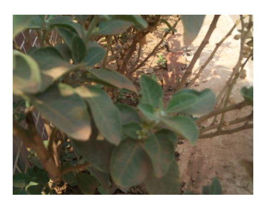
Figure 1: Plant of Medical importance: With aniasominifera