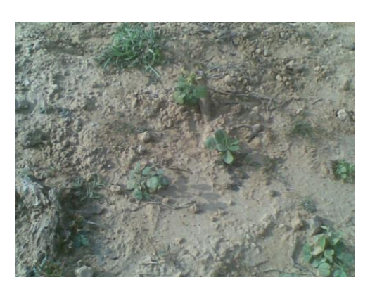
Figure 2: Endangered form of With aniasominifera Source- Sirol village, Gwalior